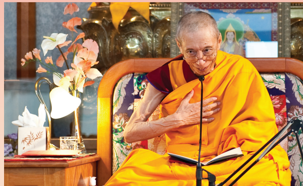
'Buddha's teachings are beneficial to others only if there are qualified Teachers.' Venerable Geshe Kelsang Gyatso Rinpoche

Accommodation will be in dormitories reserved exclusively for students on the course.